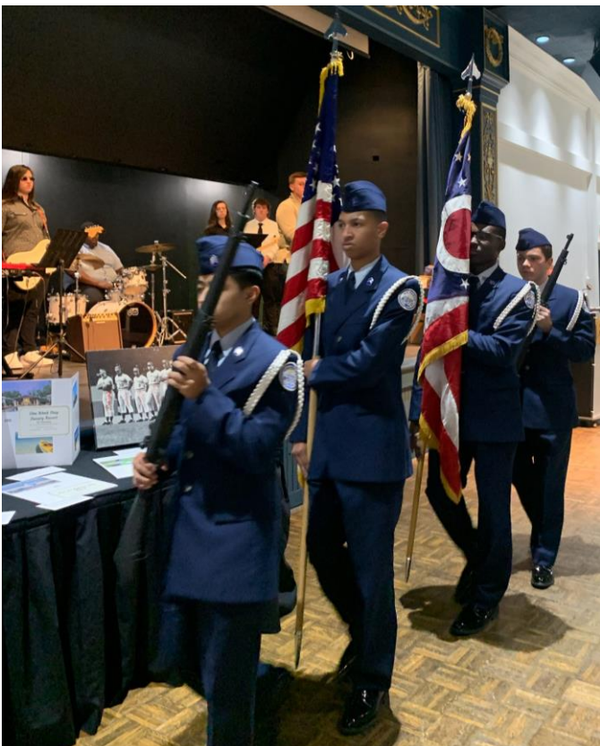
Fort Hayes was fully represented at the Charity Newsies Annual Gala: band members played background music and the national anthem and the ROTC Color Guard Presented the Colors.

It gives you results. The best measure for anything is progress. And there's nothing else that brings more results on a consistent basis than hard work. What's more, action itself leads to more action and at any moment of the day, you're building momentum and making sure your journey continues. Working on your goal itself is the motivation you need to keep moving forward and say no to distractions from daily life. Seeing results makes you feel accomplished, grateful and truly satisfied with what you're doing. That makes the whole process more enjoyable and you find the strength to persevere.